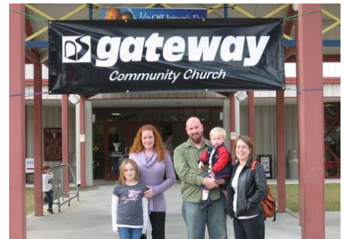
Gateway Community Church in Pooler