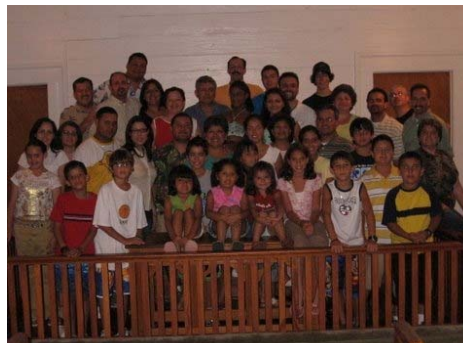
Hispanic Ministry Retreat