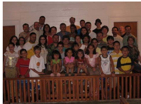
Hispanic Ministry Retreat