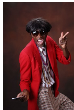
HEY YA, EMCEE