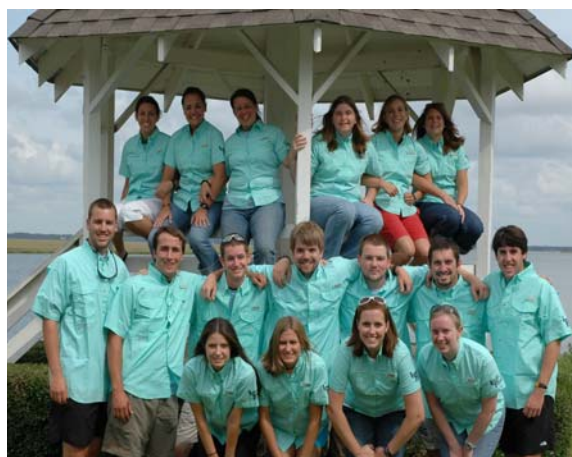
2007 Leadership Team